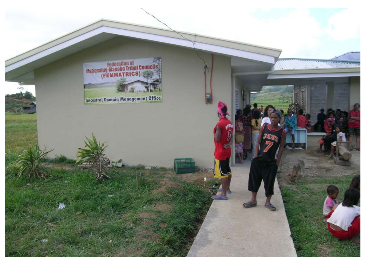
Fig. 22. The Ancestral Domain Office of the Federation of Matigsalu-Manobo Tribal Councils (FEMMATRICS). The office was built with money from an investor who wanted to lease part of the Ancestral Domain for an agro-industrial plantation.

and title respectively, many groups are pressurized by sheer necessity to do so. If they do not, they cannot - with a view to their financial, legal and commercial needs - move forward.<sup>148</sup>