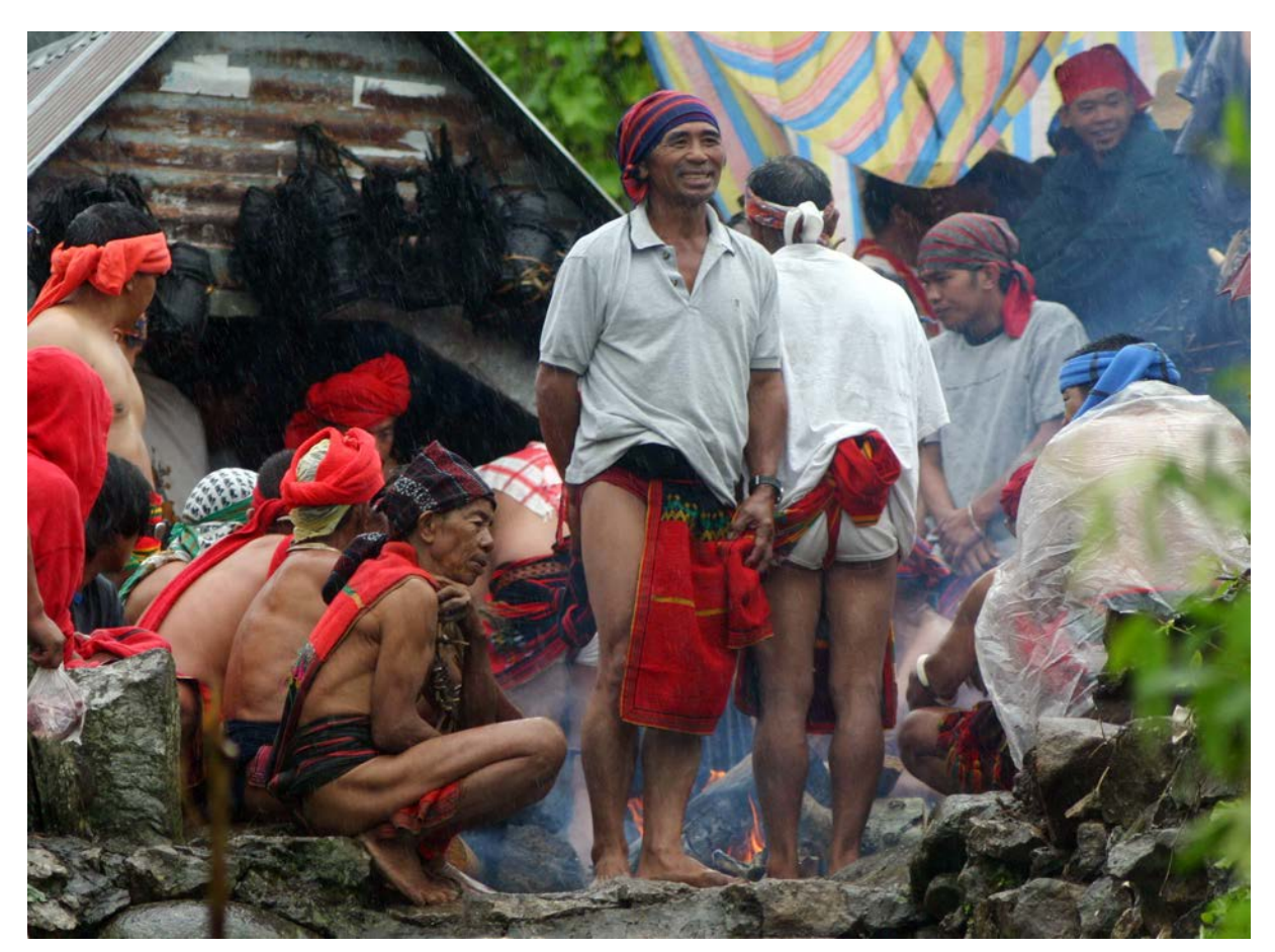
Fig. 18. Kankana'ey men from the Cordillera region attending a traditional ceremony.

Despite the use of an ethnic variable in the population census of 2010, no official figures on the indigenous population of the Philippines have been made public. It is estimated that indigenous peoples number between 10% and 20% of the national population, or 10 to 20 million. They are concentrated in the Cordillera mountains of Luzon island in the North and Mindanao island in the South. Smaller populations live on Palawan and Mindoro island, the Visayas islands and parts of Luzon. 108