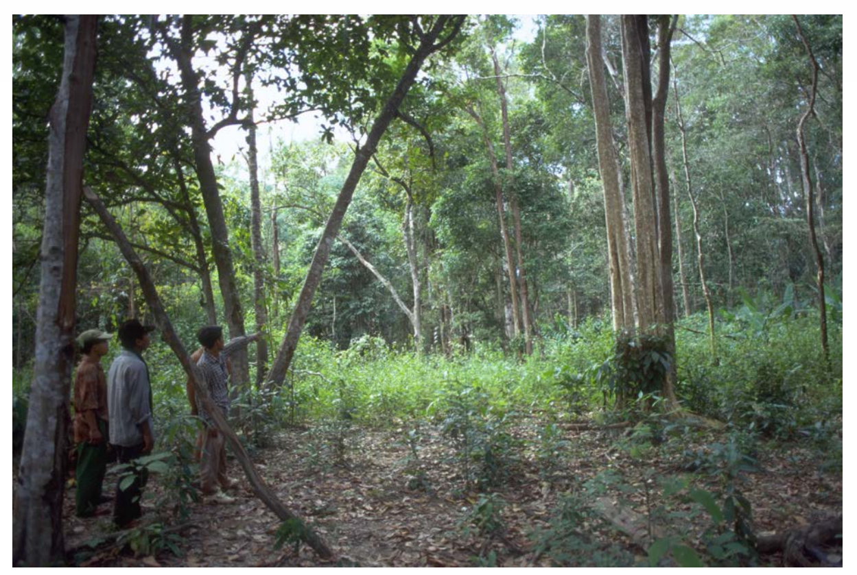
Fig. 13. Spirit forest of a Tampuan community in Ratanakiri province.