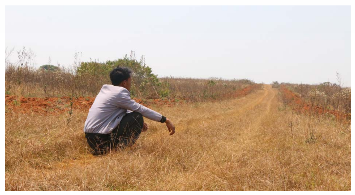
Fig. 02. Land confiscated by Shwe Than Lwin Company. A road was made for transporting crops, but most of the land has not been planted and is not used in any other way.

Except for a few farmers and those cases in which the ownership was unclear or there was a conflict, all farmers accepted the compensation offered by the company for their land. Although the amount of compensation was too little and far below the current market price, most of the farmers accepted it. There are several reasons for that. Many farmers believed that they could never get their land back. Even though they were trying to negotiate with the company, they did not believe they could get their land since they knew that such cases have been rare. They were also influenced by the propaganda of brokers. These men would visit the farmers, bringing them small gifts, sometimes alcohol, trying to convince them that they can help get the compensation, for which the farmers had to pay an agent fee. These brokers urged them to accept the compensation, arguing that if they did not accept while they were offered, the company could change its mind and stop offering any compensation. They were also told that they could never win a case against the company. Many farmers misunderstood the compensation, believing that the compensation was only for the loss they suffered for not cultivating their land for a decade. Many farmers did not know they could lose their land forever by signing the agreement of accepting the compensation. The compensation agreement states that by "accepting the compensation, the farmer may no longer interfere in the planting of land by the company".