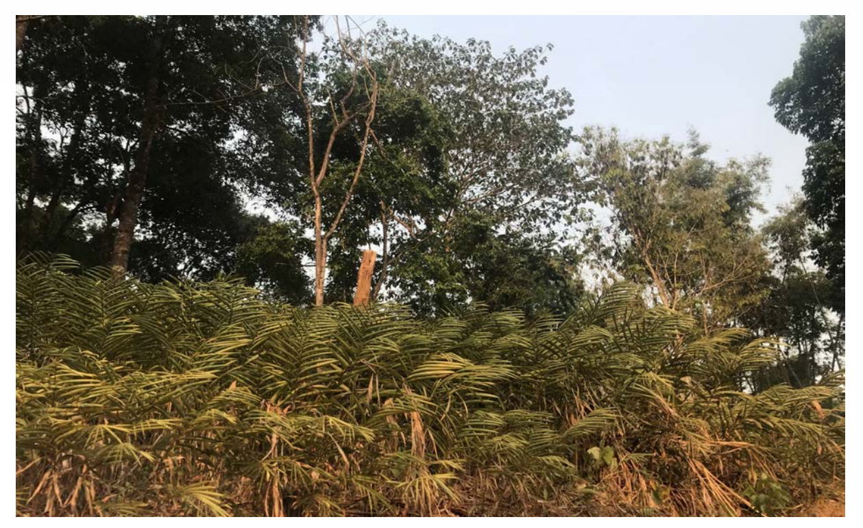
Fig. 08. Cardamom growing under trees along the road.