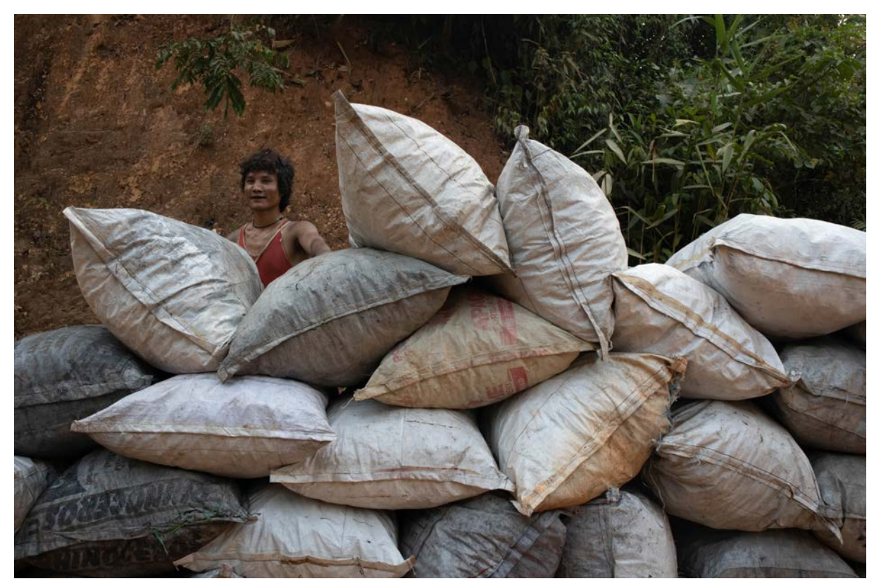
Fig. 09. Sacks of charcoal have been brought to the roadside for selling. It is another source of income of Leiktho villagers.

Among them, Amayar village is not only in Meik Thalin Taung Public Protected Forest, but also in the proposed Ma Lauk Chaung Public Protected Forest. Ma Lauk Chaung Public Protected Forest was proposed by the Forest Department without any consultation with the affected villages. They learned about the proposal due to the technical working group formed for Ma Lauk Chaung Public Protected Forest, comprised of a Member of State Parliament, officers of the Department of Land Administration and the Department of Agriculture, and village heads. The technical working group was formed without the consent of the community members. Some villagers had applied for a Form 7 for their land. The Department of Land Administration came to measure the areas, but when the villagers followed up on the application process and land measurement, they were only told that their case had been submitted to the Thandaunggyi Department of Land Administration.