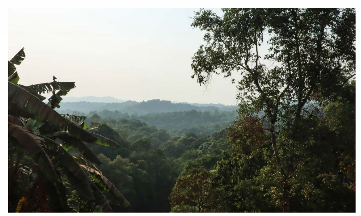
Fig. 07. The communities grow coffee, cardamom and other cash crops under large trees that form a dense canopy. These are agroforests that have been used by the Karen of Leiktho since generations.

Until today, the communities practice both customary and government administration. Some villages have communal land, and all have church land. As the population increased, there is no more land which is vacant. They said, "We don't have an inch of vacant land in our village. When you look at our place you will think it is big forest, but there are many cardamom and coffee plants inside this big forest." They do not cut down big trees when growing cardamom and coffee, since they grow better in the shade of trees. At the same time, it helps to protect the watershed. Extraction of trees for charcoal is not allowed on communal land but only in own agroforests. Besides, they get wild vegetables from the forest. Only salt, oil, garlic and onion are bought at Leiktho market and from itinerant traders who tour the villages to sell vegetables and other goods.