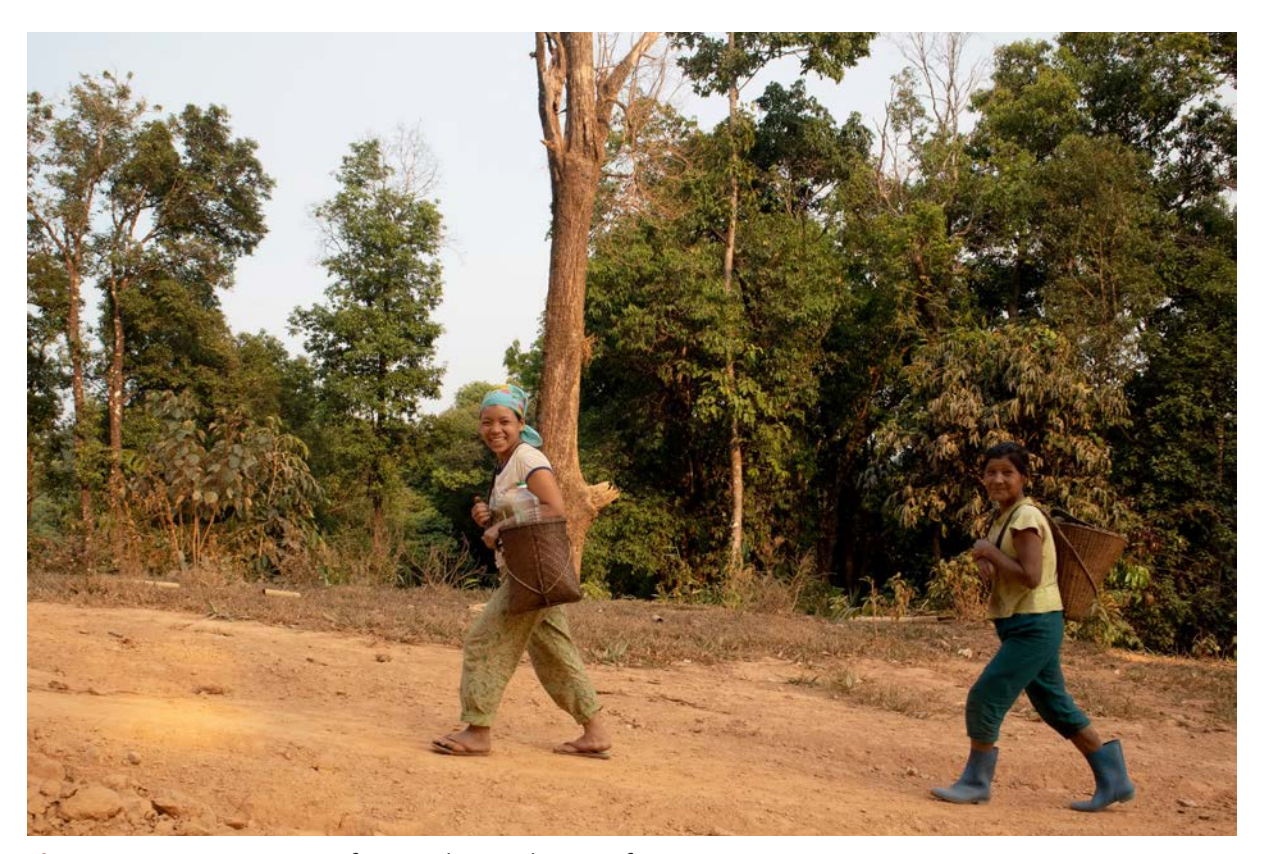
Fig. 10. Women returning from working in their agroforests.

According to focus group discussions, they are determined to defend their rights no matter what will happen in the future. Their concern is that if they lose their land there will be nothing to hand down to the future generations. They said that they are not educated, and they depend on these lands for their children's education. Most of them think that even though currently there is no direct impact of being located inside a Public Protected Forest, it will affect their children. From interviews in lower Shan Lay Pin village it was learned that officers from the Forest Department insisted that they apply for 30-years land use rights within Meik Thalin Taung Public Protected Forest, which probably means he suggested to apply for a Community Forestry Certificate. However, the villagers don't know anything about Community Forestry, and, above all, they cannot afford to pay the application fees as they are struggling with their daily livelihood. Some participants think that the creation of reserved and protected forests is like torturing. The exclusion from their native land will mean starvation and death.