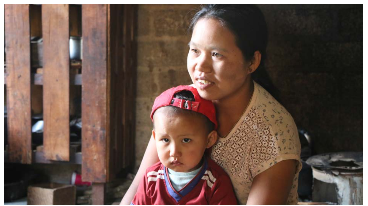
Fig. 04. Young mother from Taung Gaung Bwa village. She lost her land and now has to earn a living by making bricks.

For a 24 old mother of two children the confiscation was also a tragedy: "Because of the confiscation, my father and mother had to leave the village to work and my father got malaria and passed away. When my father passed away, I was just inside of my mother's belly and never had the chance to see my father". She could not even complete her primary school because the family had to break apart. She believes that if their land had not been confiscated, she could have completed higher education and would have a better life than she is having now.