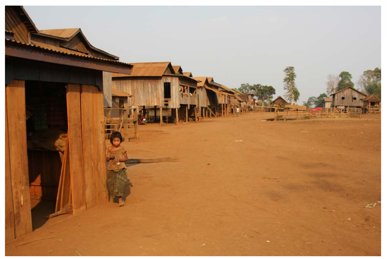
Fig. 17. Tierr village, a Tampuan community in Ratanakiri province where Order 01 was implemented causing much confusion.