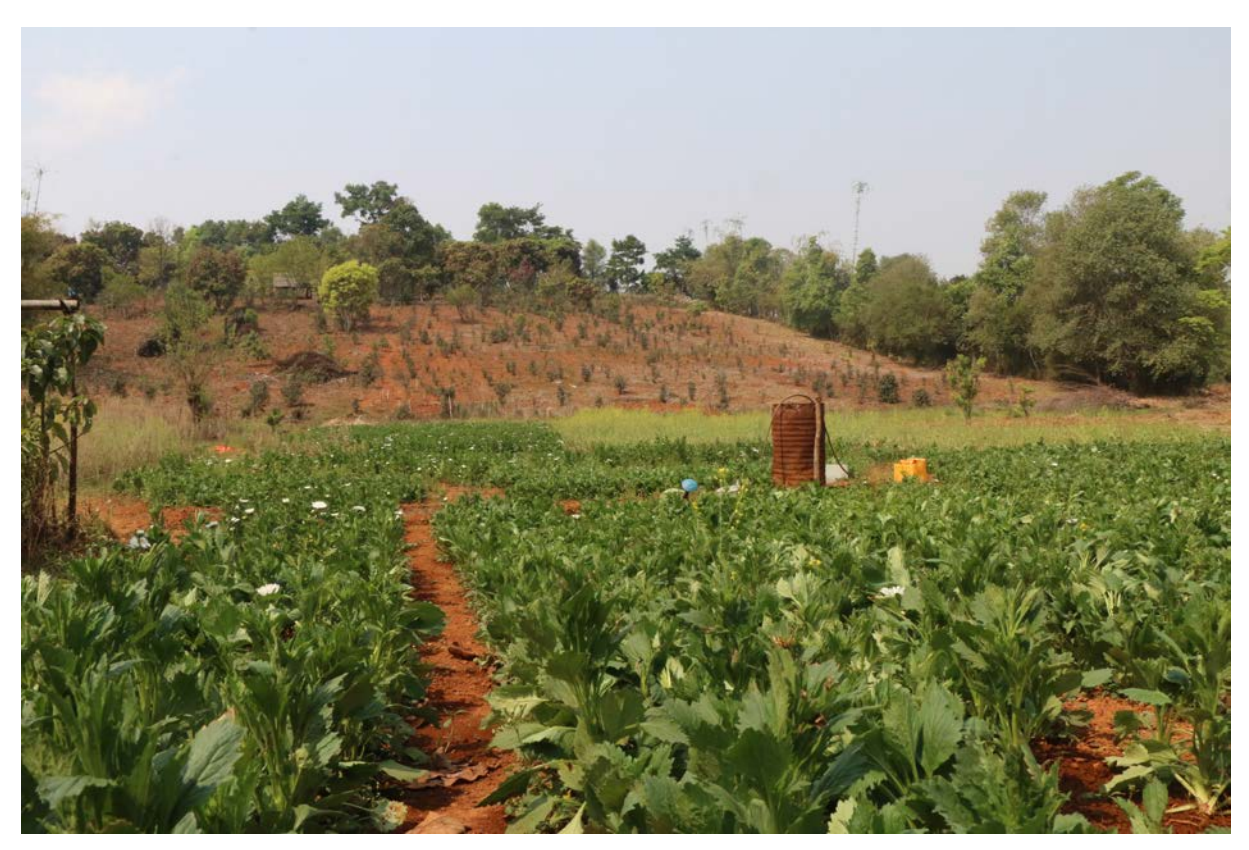
Fig. 01. Some of the remaining land of Taung Gaung Bwa village, planted with flowers as a cash crop.

The village land is red soil, which is fertile and suitable for most crops. They have classified their land into five categories: taungya land, orchard land, cemetery land, and land belonging to the temple. There is also land considered unholy where they cannot do any plantation. They believe that if they do, they will become sick or have bad luck. The village does not have vacant and virgin land, all the land is occupied. The way they got to own land is by inheriting it from their forefathers and through cultivating virgin land. They define their boundaries in the traditional way by using boundary markers such as trees and stones. In the past, whenever there were conflicts between villagers, they had to consult with elders who were honored and respected by the community and settled the case. Today, elders still play that role, but serious cases are also taken to court. Unlike in other indigenous communities, women can own and inherit land. And it is the parents' duty to give land to their children equally whenever their sons or daughters get married.