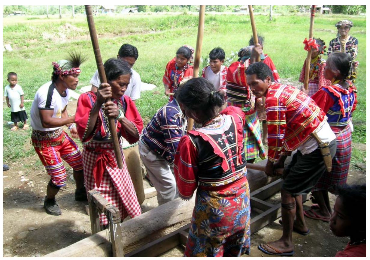
Fig. 19. Matigsalug men and women wearing traditional clothes at a celebration. The Matigsalog were one of the first indigenous people in Mindanao whose Ancestral Domain was titled.

Indigenous peoples, their ancestral domains, traditional indigenous institutions and practices are recognized in the Philippine Constitution of 1987. In 1997, Republic Act 8371, known as the Indigenous Peoples' Rights Act (IPRA), was passed. It is seen as one of the most progressive national laws for the protection of the rights of indigenous peoples, who, in the IPRA, are referred to as Indigenous Cultural Communities/Indigenous Peoples (ICC/IP). It recognizes indigenous peoples' inherent rights, including the right to self-determination, customary law, the right to a self-determined development, and to Free and Prior Informed Consent in relation to any developments impacting on them. It also recognizes indigenous peoples' right to ancestral domains (including the right to mineral and other natural resources), and the law established mechanisms for the delineation and titling of ancestral domains. The IPRA also created the office of the National Commission on Indigenous Peoples (NCIP) as its implementing agency.