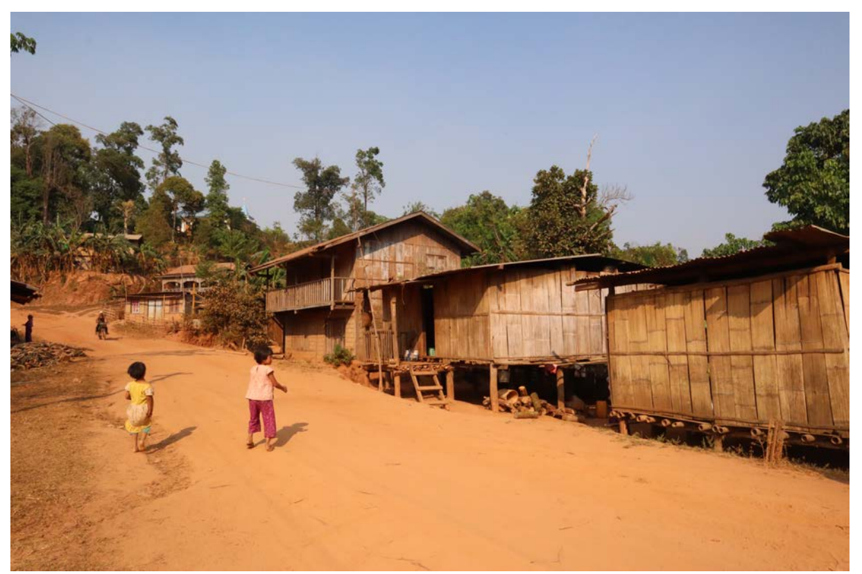
Fig. o6. Children in Upper Nan Cho village. It is one of the many villages that were made part of Meik Thalin Taung Public Protected Forest without the villagers' consent.

All these villages lie around 3000 feet above sea level and are connected with an unpaved road to the township center Leiktho.