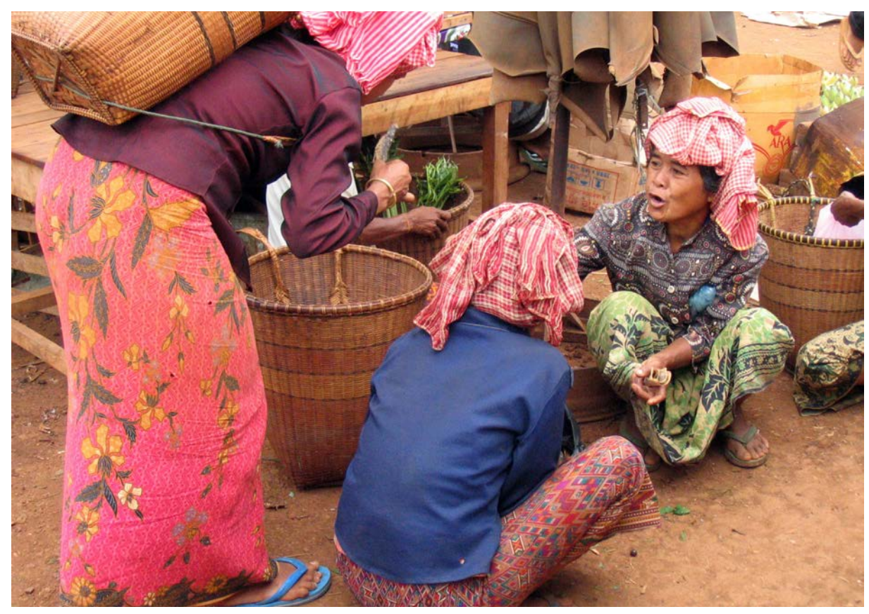
Fig. 12. Tampuan women at the market in Banlung town, the capital of Ratanikir province.