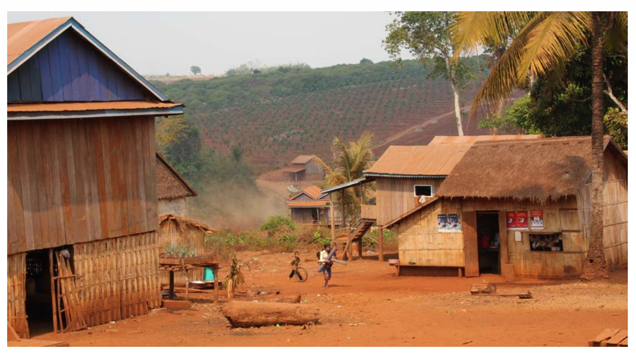
Fig. 14. Longkhung village, a Tampuan community in Ratanakiri Province. Cashew and rubber plantations have expanded right to the settlement boundary.

At the same time, titling of indigenous communities' communal land has been very slow due to the lengthy and complicated application process which requires, first, the Ministry of Rural Development to recognize the identification of an indigenous people and community; second, the Ministry of Interior to register the community as a legal entity; and third, the Ministry of Land Management, Urban Planning and Construction to carry out the land titling, including the surveying of the land, public notification and the issuing of the title.<sup>79</sup>