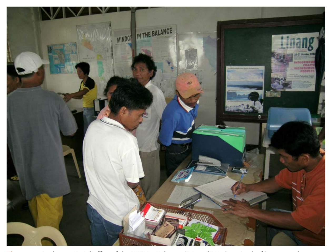
Fig. 21. At the provincial office of the NCIP in Calapan, Oriental Mindoro. Lack of human and financial resources limit the effectiveness of the NCIP's work.

it is tempting to conclude that the IPRA has already been "amended" and now only reads: "An Act Creating A National Commission on Indigenous Peoples, Appropriating Funds Therefor and For Other Purposes". What happened to the words, "To Recognize, Protect and Promote the Rights of Indigenous Cultural Communities/Peoples? These latter were the letter, and the heart, and the spirit of the law.