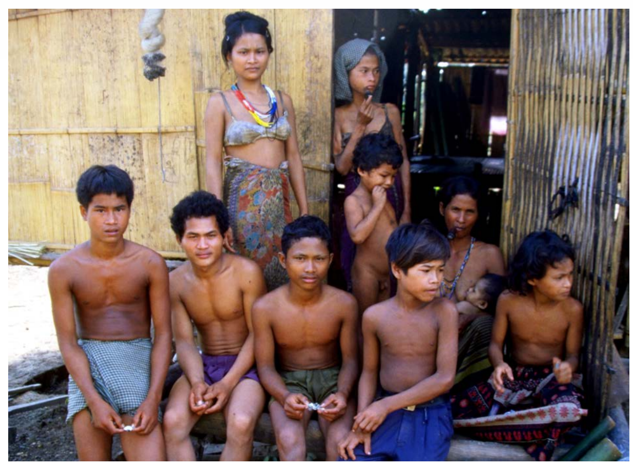
Fig. 11. Members of the Kavet community Lam Oeuy in Ratanakiri province.