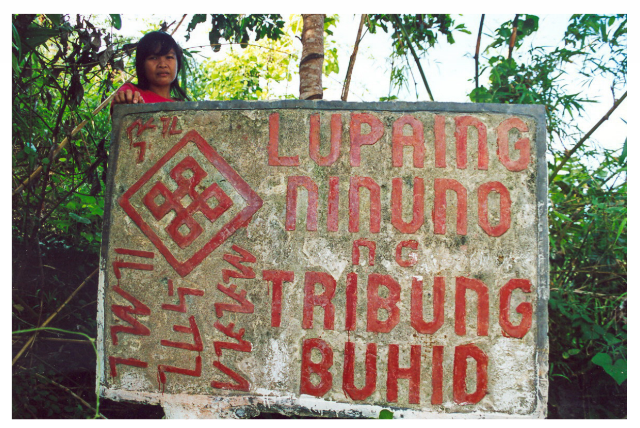
Fig. 23. Signboard at the boundary of the Ancestral Domain of the Buhid of Mindoro island. The Buhid have great difficulties preventing encroachment by illegal loggers and settlers.