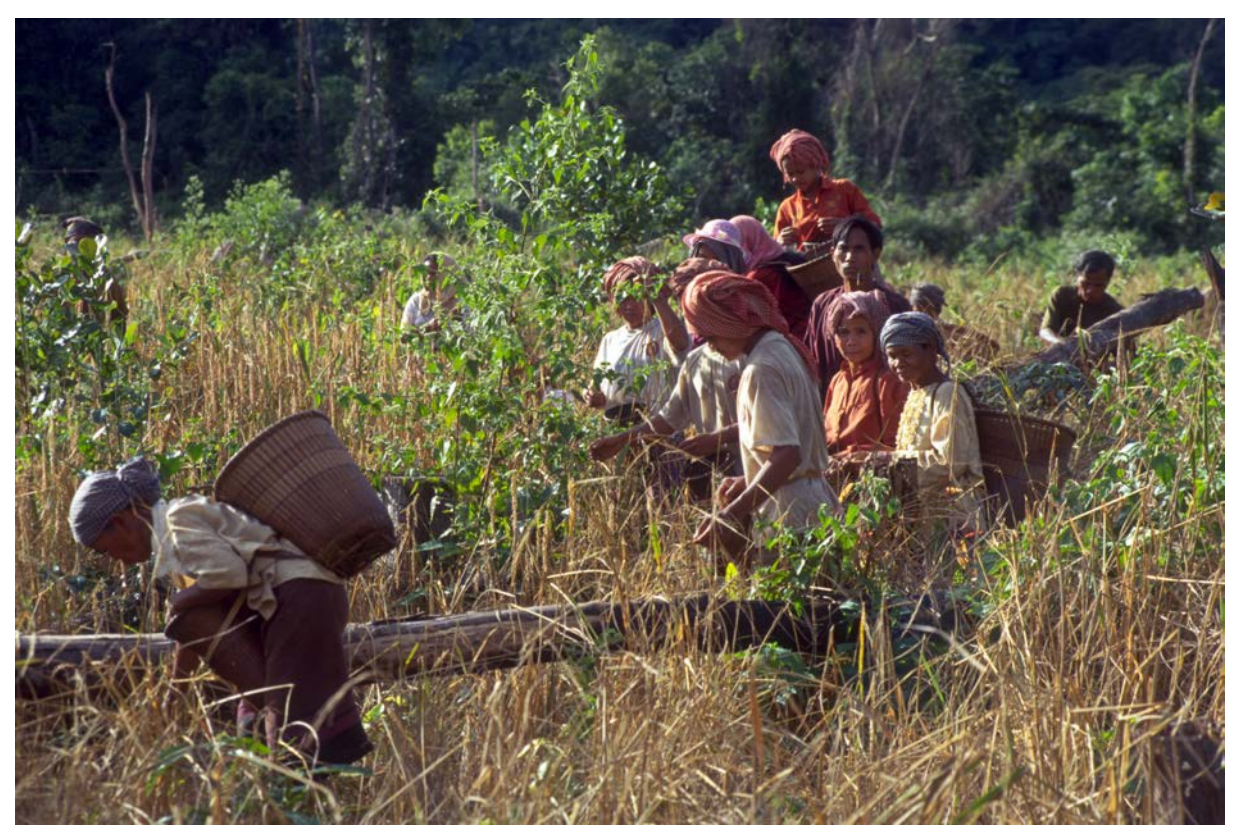
Fig. 16. Villagers of Kralah, a Kreung community in Ratanakiri province, harvesting shifting cultivation rice. The photo was taken in 1998. Today, many Kreung and in other indigenous communities do not practice shifting cultivation anymore.

The identification of indigenous communities in article 23 as a group of people who have a "traditional lifestyle" and "cultivate the lands in their possession according to customary rules of collective use", and the need to demonstrate that they are indigenous and have a 'traditional lifestyle' in order to be able to make their claims has led to confusion and insecurity among some indigenous communities. Communities which do not practice shifting cultivation or feel they do not have a 'traditional lifestyle' any longer, may not even consider applying. Fortunately, the government does not really enforce the provisions of the law related to 'tradition'.